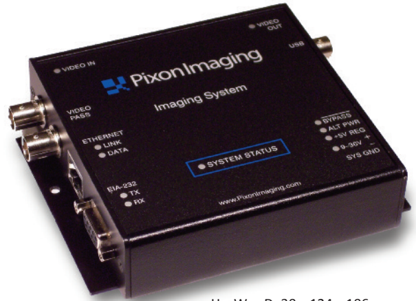
H x W x D: 30 x 124 x 106mm Weight: 375g

Pixion Imaging's enhancement process originated from image enhancement technology for astronomy. Our decades of experience has resulted in the world's leading information-based model for identifying essential image information and cleanly separating it from noise and artifacts.